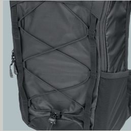
Elastic carry-all system