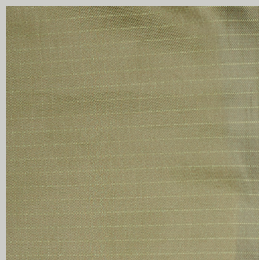
Light ripstop Fabric

VOLUME 18L LIGHT RIPSTOP FABRIC ERGONOMIC AND BREATHABLE SHOULDER STRAPS ADJUSTABLE HIP BELT ADJUSTABLE STERNUM STRAP 2 SIDE MESH POCKETS TOP ZIPPERED POCKET BREATHABLE BACK PANELS ZIPPERED LATERAL POCKET YKK EXPEDITION PULLER EXPEDITION PRINT 0,46 KG