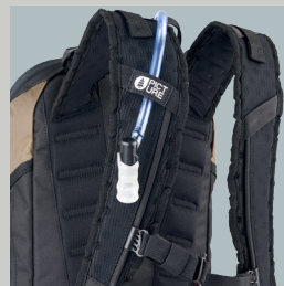
Hydration system / Laptop 13" compatible