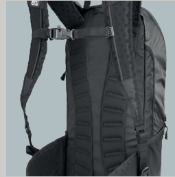
Breathable & ergonomic back panel