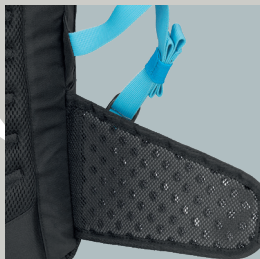
Breathable hip belt