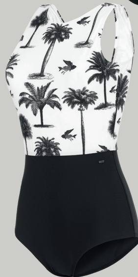
A Palmer Fish