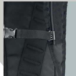
Adjustable sternum strap