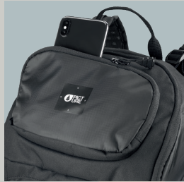
Fleece lined accessories pocket