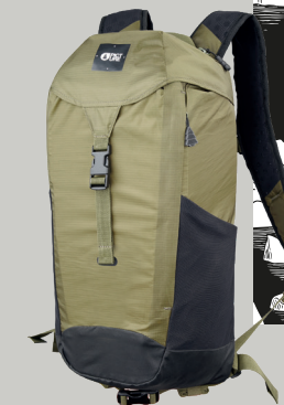
B Black Military